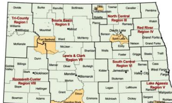
Indian Reservations of North Dakota